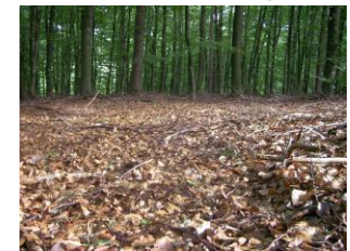
Forest floor layer