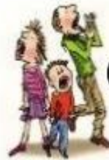
Shout it out