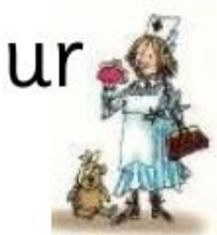
Nurse with a purse