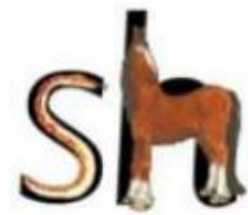
sh says the horse to the hissing snake