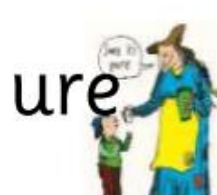
Sure us pure