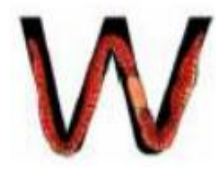
Down up, down up