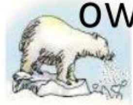
Blow the snow