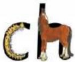
The horse sneezes when the caterpillars hairs get up his nose chuh-han