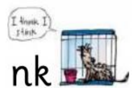
I think I stink