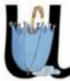
Down and under the umbrella, up to the top and down to the puddle