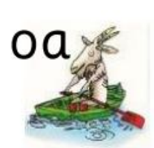
Goat in a boat