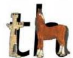
The princess in the tower is saved by the horse, thank you!