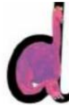
Around the dinosaurs bottom and up to his neck