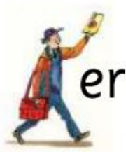
A better letter