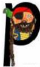
Down the pirates plait and around the pirates face