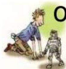
Toy from a boy