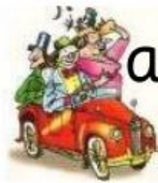
Start the car