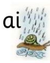
Snail in the rain