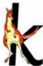
Down the kangaroo's body curl his tail and leg