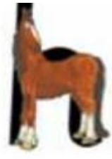
Down the horses head to his hooves and over his back