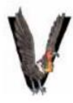
Down the wing up the wing