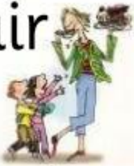
That's not fair