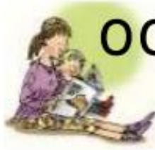
Look at a book