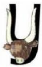
Down a horn, up a horn and under the yak's head