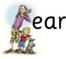
Hear with your ear