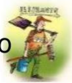
Poo at the zoo