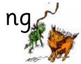
Thing on a string