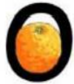
All around the orange