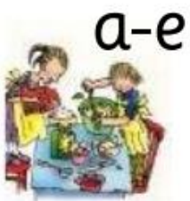
Make a cake