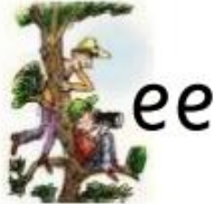
What can you see?