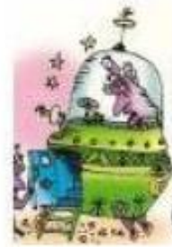
Shut the door