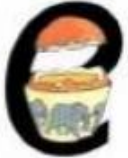
Slice into the egg, go over the top, then under the egg.