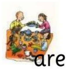
Care and share