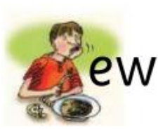
Chew and stew