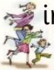
Whirl and twirl