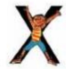
Down the arm and leg, repeat the other side