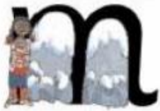
Maisie, mountain, mountain