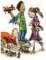
May I play?